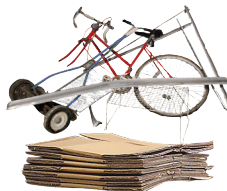
Scrap metal, cardboard (flattened & bundled)