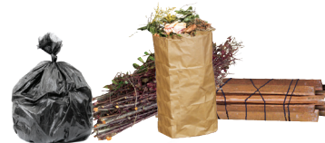
Bagged or boxed garbage, plant debris, branches, clean wood.

Must be bundled, maximum size 4 foot by 2 foot.